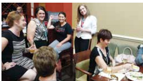
The official After Party