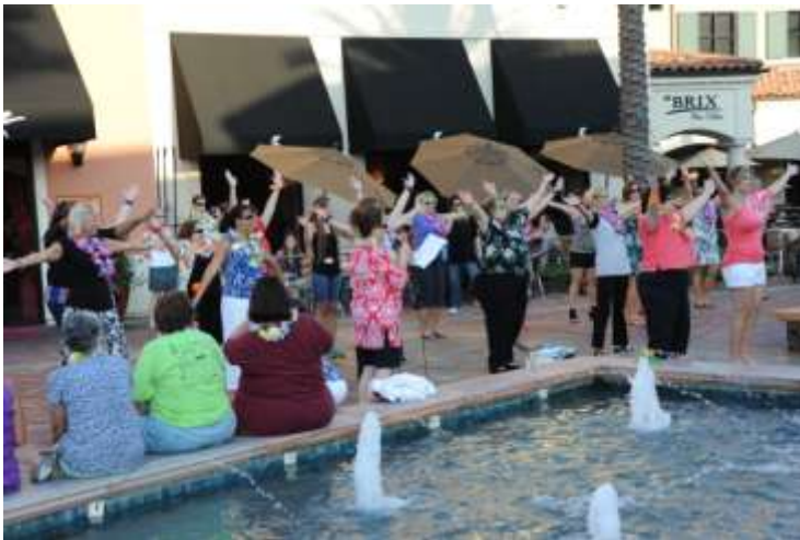
CYFEN Members and Friends